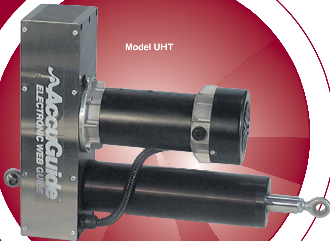
Part of the most advanced web guide system available today

The industry's most rugged and reliable, high-performance linear actuators